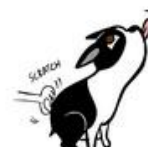
"I LOVE YOU, DON'T STOP"