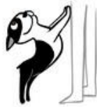
"I'M FRIENDLY!" play bow